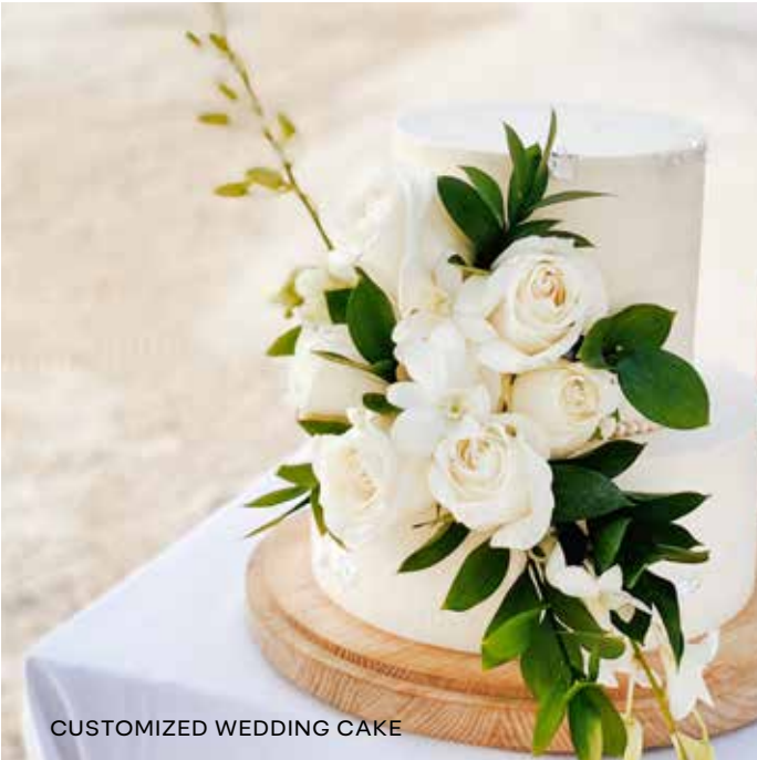
CUSTOMIZED WEDDING CAKE