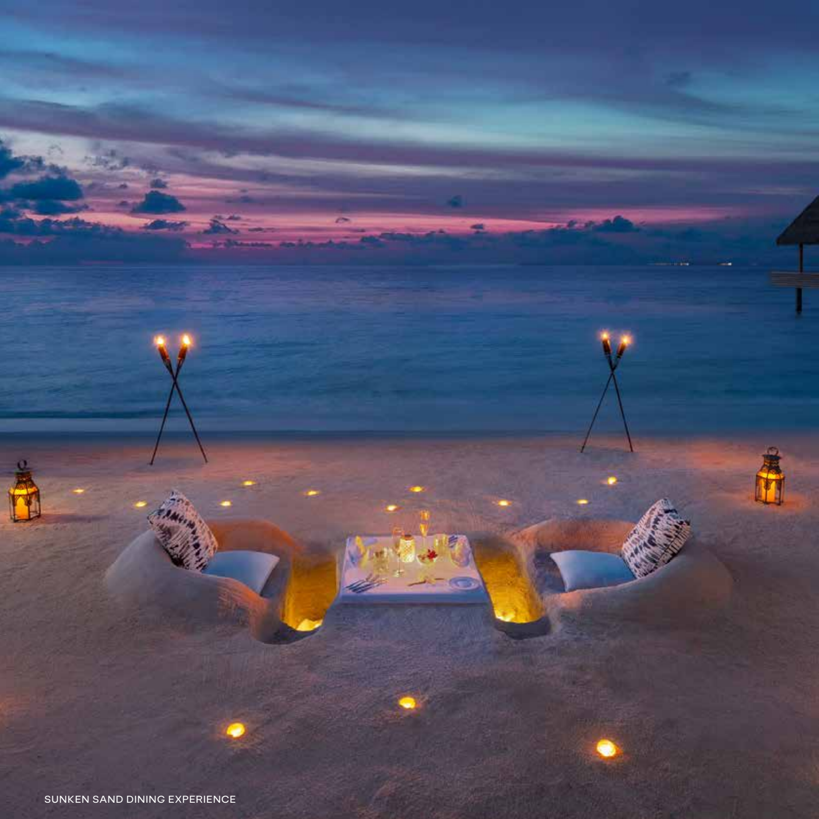
SUNKEN SAND DINING EXPERIENCE